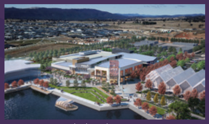
Googong Town Centre artist's impression.

Council approved the Structure Plan for the Googong Town Centre in May 2023, and we anticipate DA approval for the first Stage of the Town Centre in August 2023. This will be a major milestone and we hope to be able to announce a more specific program for Stage 1 of the Town Centre in the next few months.