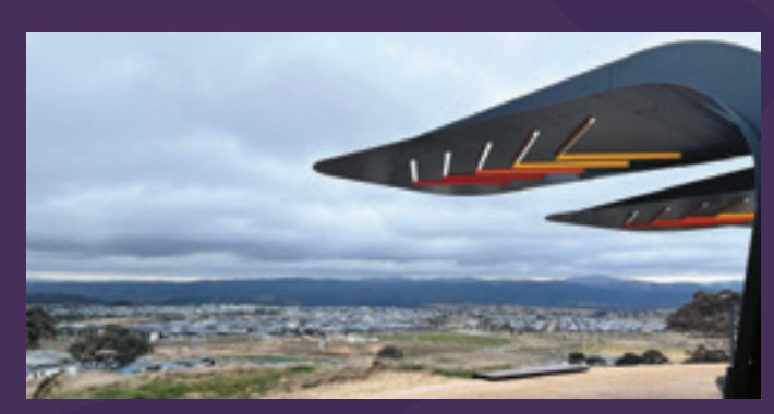
The view from the new Nangi Pimple lookout.

The lookout structures atop Nangi Pimble Reserve have been completed with only the integrated seating to be complete. The view is spectacular from the lookout, particularly on these cold misty mornings! The reserve has been revegetated over the last 5 years with trees that are the main food source of the vulnerable Glossy Black Cockatoo, and the lookout shelter design is inspired as such. In addition to the Nangi Pimble Reserve, construction is well underway on the 3rd dog park. This dog park has been split into 2 sections to separate bigger dogs from smaller dogs and both sections will include an array of dog play equipment. It is planned to be open to the public by the end of Spring 2023.